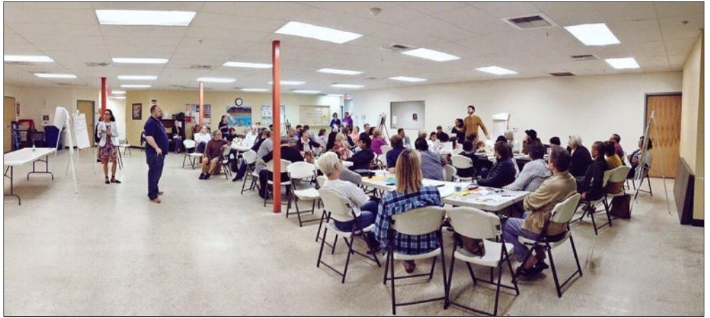
GP and CD14 Verdugo Road Workshop - May 2016 Lorem ipsum dolor sit amet, consectetur adipiscing elit, sed do eiusmod tempor incididunt ut labore et dolore magna aliqua.

Lorem ipsum dolor sit amet, consectetur adipiscing elit, sed do eiusmod tempor incididunt ut labore et dolore magna aliqua. Ut enim ad minim veniam, quis nostrud exercitation ullamco laboris nisi ut aliquip ex ea commodo consequat. Duis aute irure dolor in reprehenderit in voluptate velit esse cillum dolore eu fugiat nulla pariatur. Excepteur sint occaecat cupidatat non proident, sunt in culpa qui officia deserunt mollit anim id est laborum.